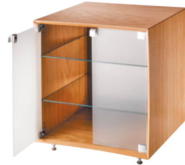
HIFI Qube Oak with Sandblast doors and adjustable feet.