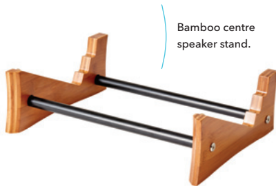
Bamboo centre speaker stand.