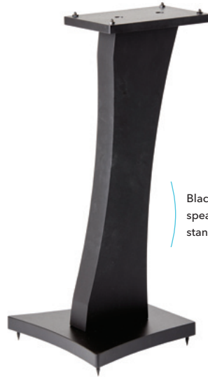
Black speaker stand.