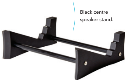
Black centre speaker stand.